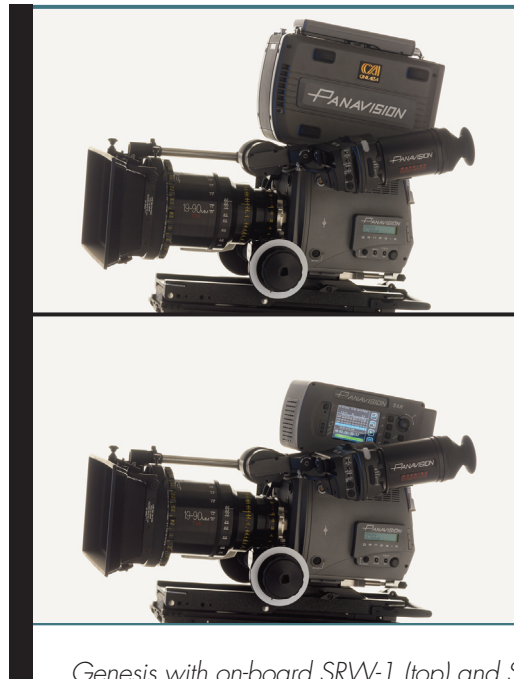
Genesis with on-board SRW-1 (top) and SSR-1