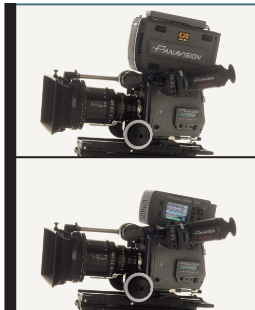
Genesis with on-board SRW-1 (top) and SSR-1